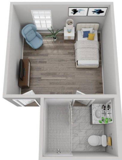
STUDIO APARTMENT 197 SQUARE FEET