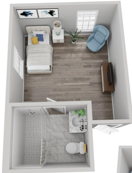
DELUXE STUDIO 217 SQUARE FEET